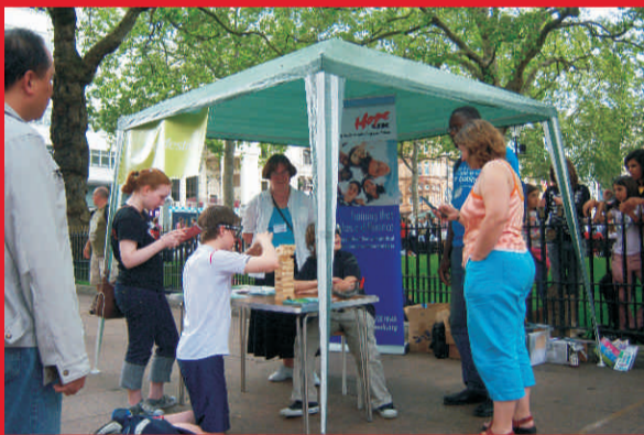
Hope UK Educators providing alcohol awareness during the Pentecost Festival in central London

Gweini member Hope UK intends to expand its drug education and prevention activities so that its Drug Educators are reaching 500,000 children and young people a year by the end of 2011. There are already 12 Educators in Wales and the aim is to increase this number to 50 in that period so that every Welsh community has access to drug and alcohol education.