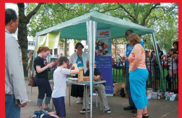
Addysgwyr Hope UK yn darparu ymwybyddiaeth am alcohol yn ystod Gŵyl y Pentecost yn Llundain Canolog

Mae alcohol a thybaco'n cael eu cynnwys yn ei sesiynau Ymwybyddiaeth a Hyfforddiant Cyffuriau. Mae'r cyflwyno'n digwydd gan bennaf trwy Addysgwyr wedi'u hyfforddi ar gwrs sydd wedi'i achredu gan Rwydwaith y Coleg Agored. Mae'r rhaglen hyfforddi 120 awr hon yn paratoi unigolion i gyflwyno sesiynau ymwybyddiaeth am gyffuriau mewn ystod eang o